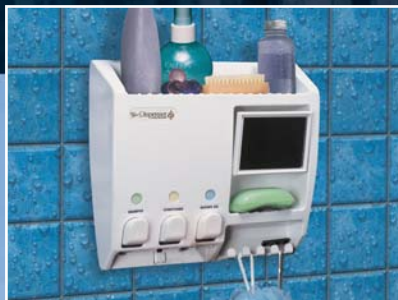
73350 Ulti-Mate Dispenser III with Mirror White